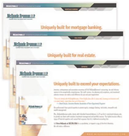
targeted marketing postcards